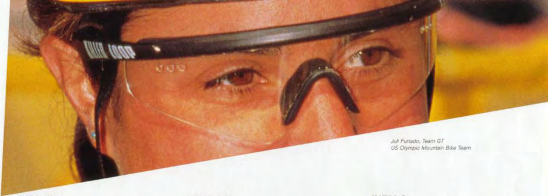
Juli Furtado, Team GT US Olympic Mountain Bike Team